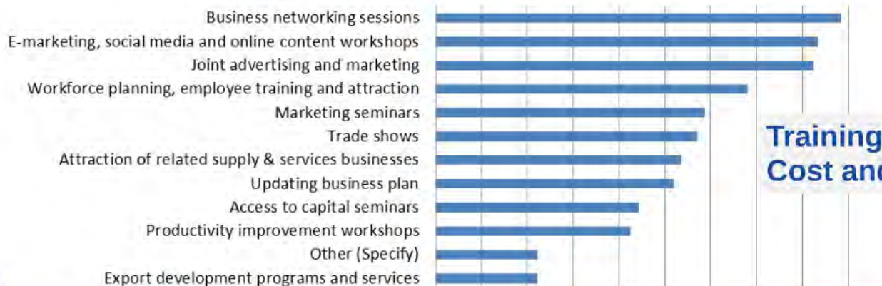
Figure 8: Assistance and Opportunities of Interest to Businesses

Training barriers? Cost and local availability